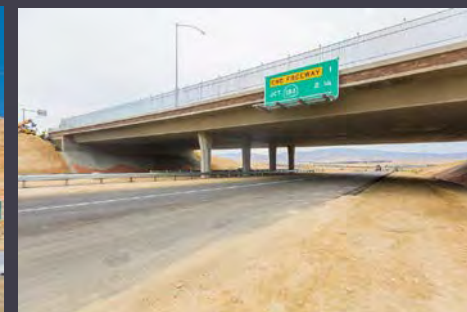
State Route 178 Progress and Completion photos