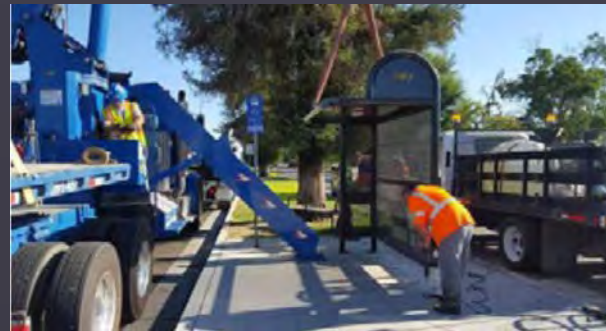
Improvements to 51 Bus Stops in Metro Bakersfield and Disadvantaged Neighborhoods