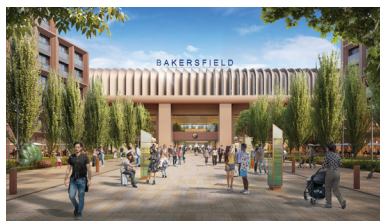
Rendering of the new HSR station in Bakersfield

Early HSR operations are expected to begin on the 171-mile Merced to Bakersfield segment between 2030 and 2033, and construction is well underway between Madera and north of Bakersfield. The Bakersfield HSR Station will be a key component of initial HSR operations. As the backbone of the integrated passenger rail/transit vision for the San Joaquin Valley, HSR will be the catalyst for substantially improving public transportation throughout Kern County and the region.