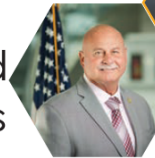
JERRY DYER City of Fresno Mayor